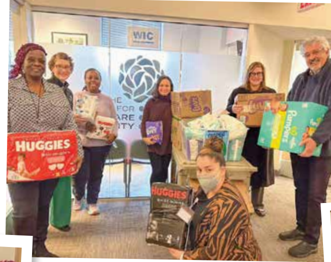
Delivering diapers collected in our office.