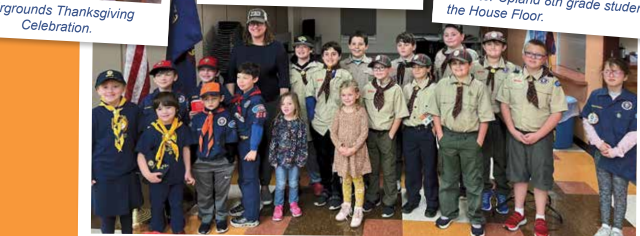
Cub Scout Pack 225.