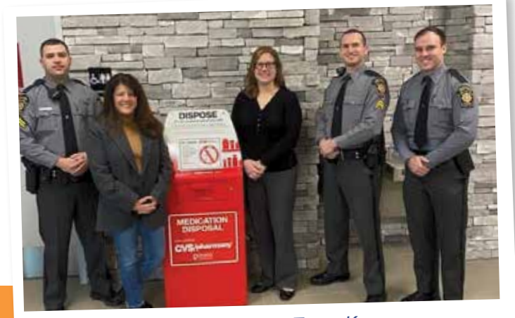
PA State Police Troop K.