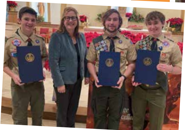
Court of Honor with Boy Scout Troop 225.