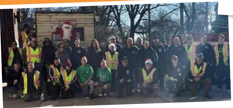
Garden City Fire Co. #1.